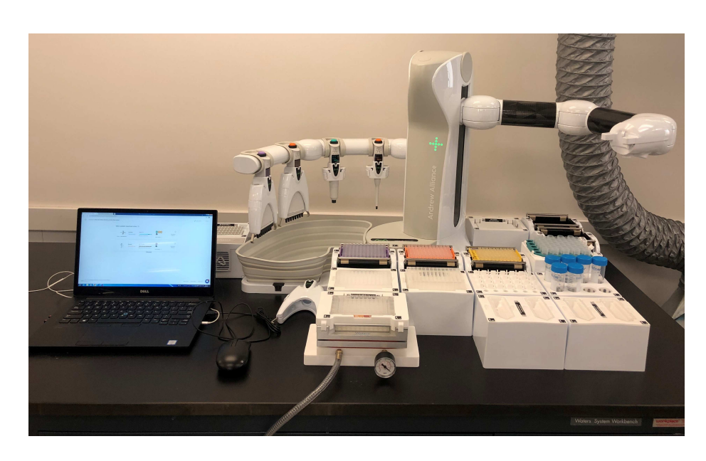
Figure 2. Andrew+ Automation Workflow Setup for Oasis 2x4 Method Development