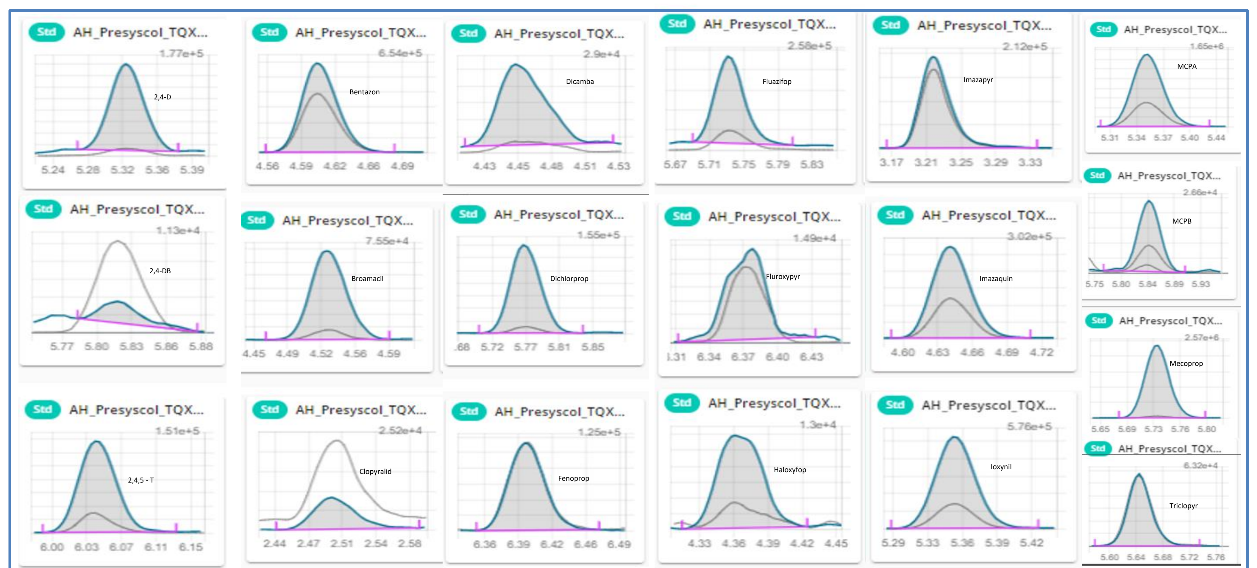
Figure 4. Chromatograms for acidic herbicides in drinking water at 0.02µg/L acquired and processed in waters_connect.

Excellent sensitivity and selectivity were demonstrated by the response for each compound detected from the analysis of drinking waters spiked at 0.02 µg/L, which is well below the maximum limits. Figure 4 shows an overlay chromatograms with 2 MRM transitions for all studied analytes in drinking water. Data processing using the MS Quan application in waters_connect for quantitation software platform allows for easy visual representation and review of data. Laboratories are expected to provide methods with lower limits of quantification (LLOQ) of at least one third of the EQS. The sensitivity observed suggests that detection and quantification of all compounds at lower concentrations should be possible.