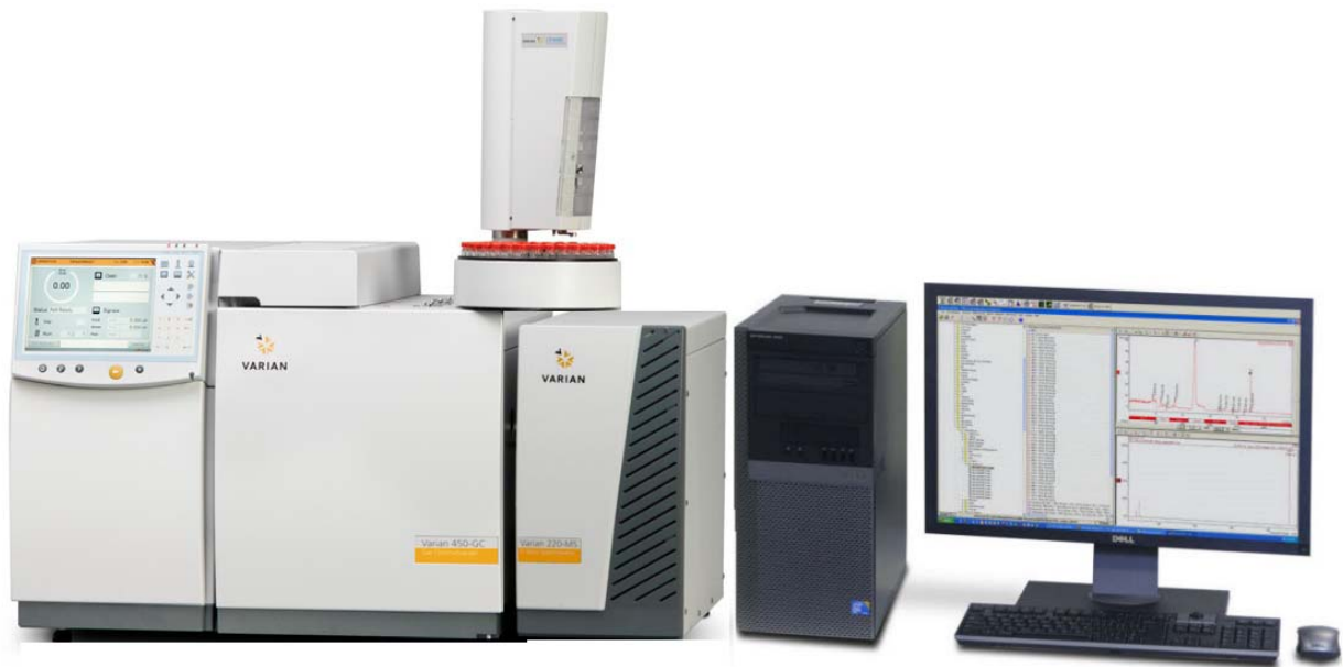
Figure 2 Layout for the GC/MS with the 450-GC

In Figure 2 the 450-GC is to the left of the MS to allow the transfer line to connect to the GC/MS. The bench must be wide enough and strong enough to support the weight of the system and additional equipment see Table 3 and Table 4. The bench must be at least 84 cm (33 in.) deep.