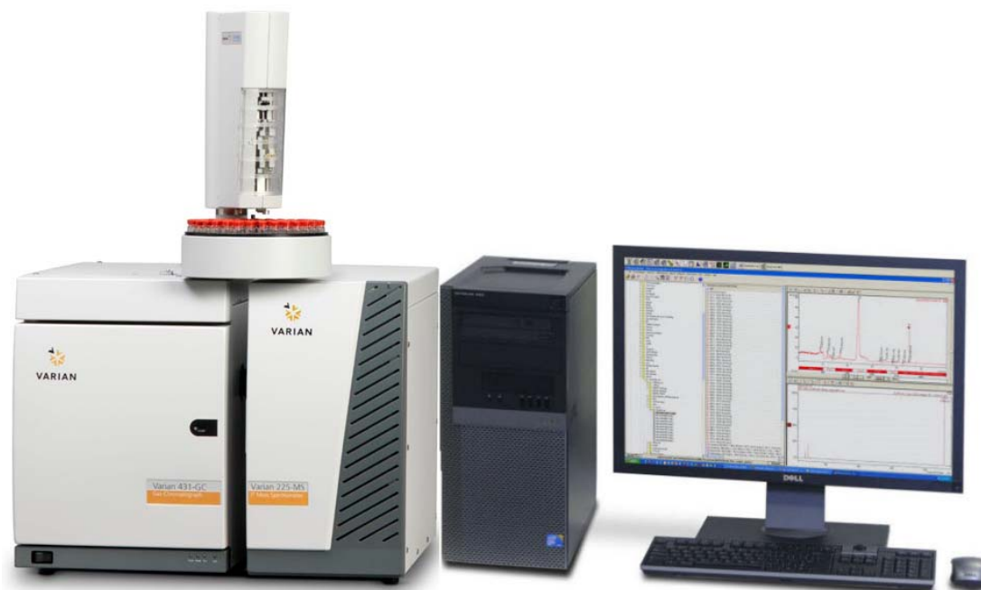
Figure 1 Layout of the GC/MS with the 431-GC

In Figure 1, the 431-GC is to the left of the MS to allow the transfer line to connect from the GC to the GC/MS. The bench must be wide enough and strong enough to support the weight of the system and any additional equipment see Table 1, and Table 2. The bench must be at least 84 cm (33 in.) deep.