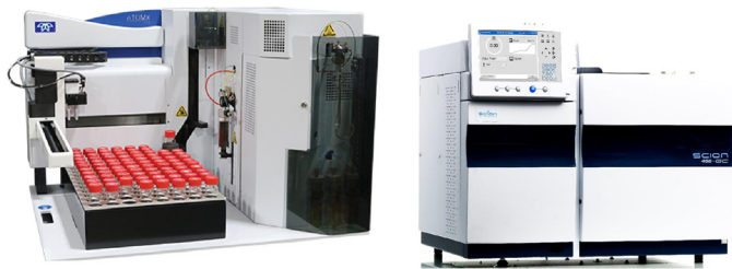
Fig 1. Atomx XYZ Purge and Trap System with SCION 456 Single Quad MS

High purity water was gravimetrically spiked with low level concentrations of 1,4-Dioxane. Since standards were prepared with a concentration range of 0.3 ppb to 6 ppb, with the addition of fluorobenzene as an internal standard. Samples were prepared using the Atomx Sparge 5mL vessel with no heating unit installed on the purge and trap system.