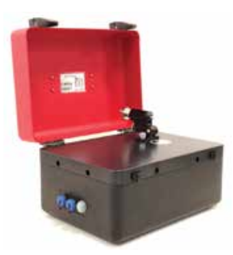
4500 series portable FTIR