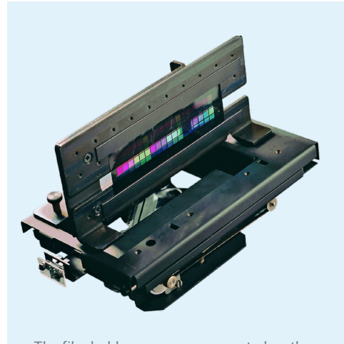
The film holder accessory, mounted on the sample transport accessory

For more information. www.agilent.com/chem