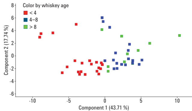
Figure 3. MPP-generated 2D PCA plot of whiskeys of various ages, indicating the ability to differentiate the less than 4 year old whiskeys from those older than 4 years.

Whiskeys (33) from the major producers were placed into three categories by age: barreled four years or less at bottling, barreled between four and eight years, and barreled eight years or longer at bottling. Figure 3 shows the results of the PCA, using the averages of the three replicates for each whiskey. While the whiskeys of intermediate age (4 to 8 years) could not be totally differentiated from the oldest whiskeys, the youngest whiskeys (< 4 years) were differentiated from the others. The lack of total differentiation by age may be due in part to the difficulty of obtaining accurate age information on the various products. In particular, some of the whiskeys > 8 years may be blends of whiskeys of various ages.