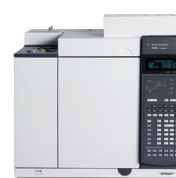
Agilent 7890B GC