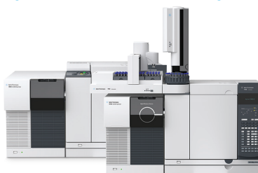
Agilent 7000D and 7010B Triple Quadrupole GC/MS