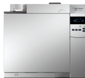
Agilent 7820A GC