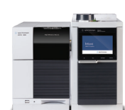
Agilent 5977B GC/MSD