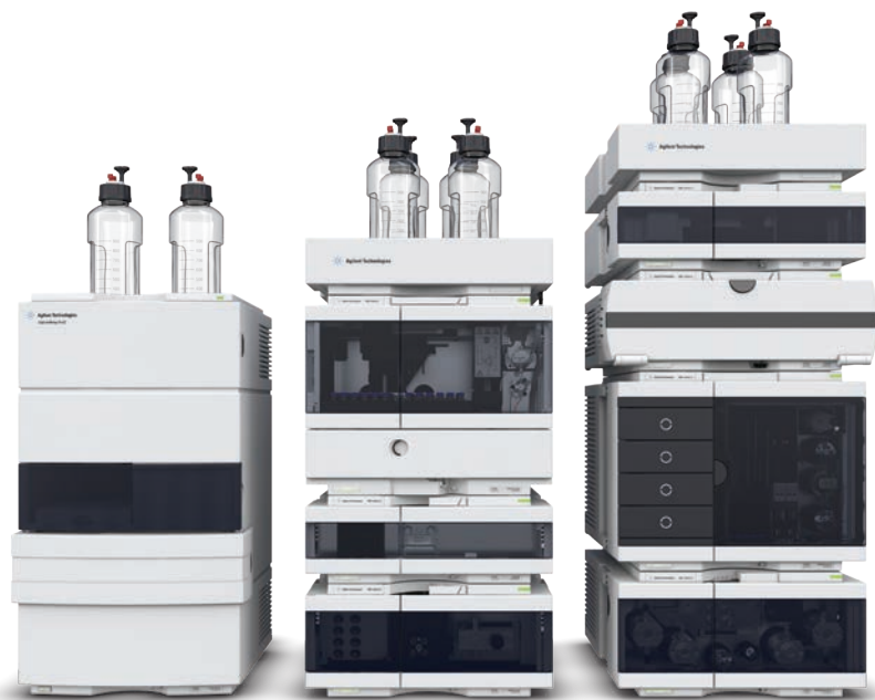
Agilent 1220 Infinity II LC

From routine analysis to cutting-edge research, the Agilent InfinityLab LC Series offers the broadest portfolio of LC systems and solutions for any application and budget to achieve the highest efficiency.