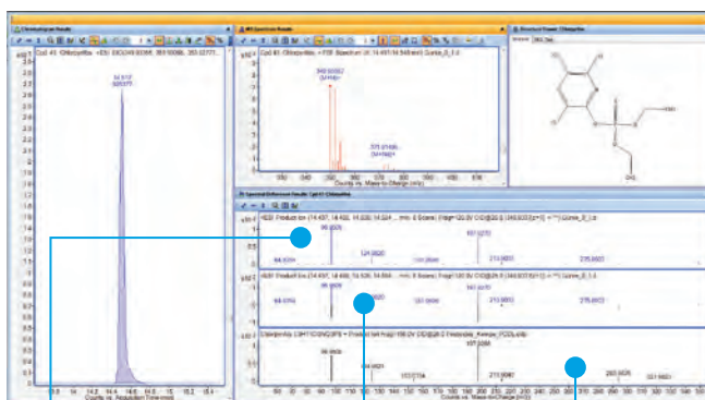
Top: Auto MS/MS spectrum Middle: Mirror spectrum Bottom: Library spectrum

Reliably confirm compounds by library matching using Auto MS/MS.