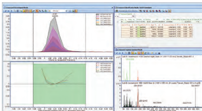
Straightforward data mining and unambiguous identification using All Ions Software.

Simply put, the Pesticide PCDL makes compound confirmation and data mining easier, even for high-throughput labs.