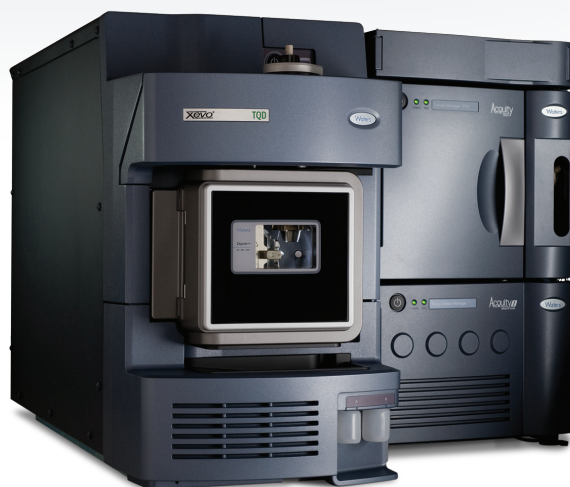
Figure 1. Waters ACQUITY UPLC I-Class System with Xevo TQD Mass Spectrometer.

The challenge of serum 17-hydroxyprogesterone, cortisol, and androstenedione measurement is made routine with UPLC-MS/MS for clinical research.