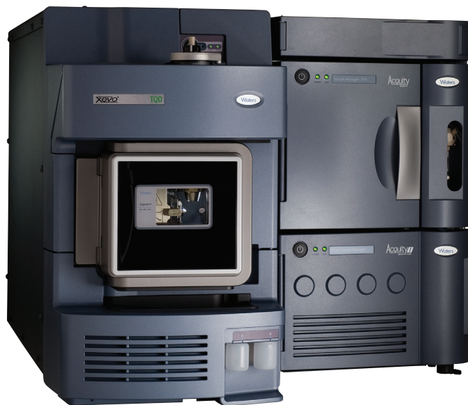
Figure 1. The Waters ACQUITY UPLC I-Class System with the Xevo TQD.

Here we describe a clinical research method using deproteination of plasma or serum samples with methotrexate- 2 H 3 internal standard in methanol. Isocratic separation was achieved within five minutes using an ACQUITY UPLC HSS C 18 SB Column (2.1 x 30mm, 1.8 µm) on an ACQUITY UPLC I-Class System followed by detection on a Xevo TQD Mass Spectrometer (Figure 1).