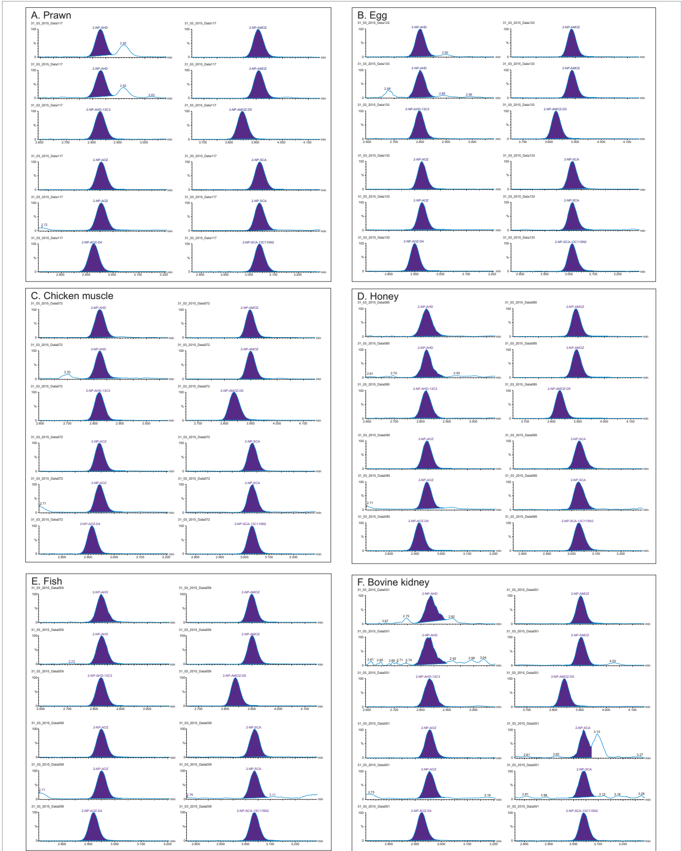
Figure 1. Chromatograms showing nitrofuran metabolites and stable isotope analogues, as NP-derivatives, from analysis of matrix-extracted calibrants of: A. Prawn., B. Egg, C. Chicken muscle, D. Honey, E. Fish, and F. Bovine kidney at the STC (0.5 µg/kg).