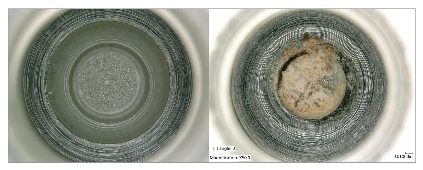
Figure 2. Accelerated corrosion testing of 2.1 mm column frits. BioResolve SCX mAb hardware is shown on the left and standard hardware on the right.

Both hardware types were exposed to 1 M sodium chloride at pH 7 for seven days at room temperature. At the conclusion of the sevenday storage, the endnuts of each column were removed and the frits were examined. The standard hardware showed visual rusting in as little as one week, whereas the BioResolve design showed none. Results of this testing are shown in Figure 2.