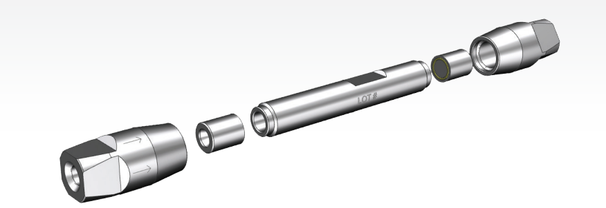
Figure 1. Explosion view of BioResolve SCX mAb Column hardware.

BioResolve SCX mAb Column hardware is purposely designed to mitigate corrosion while maintaining packed column performance.