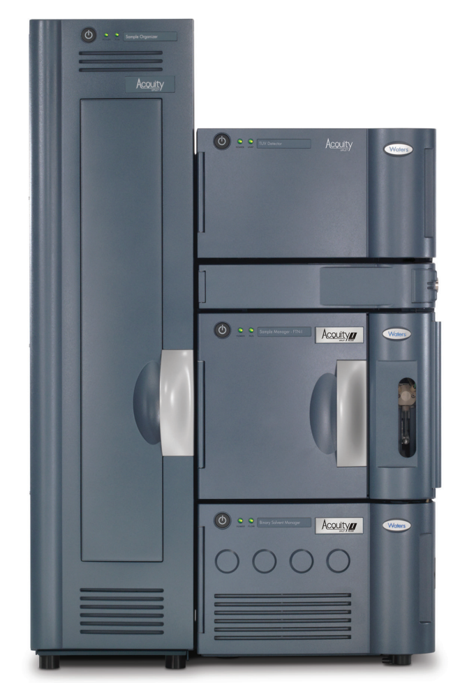
ACQUITY UPLC I-Class Plus System.

Throughout the lifetime of liquid chromatography instrumentation, many changes and improvements will be made to instrument design to improve performance, robustness, ease-of-use, or a combination of these attributes. However, it is critical that any established methods can be seamlessly transferred from existing instrumentation to the improved instrument design. In this example, two active solvent preheater (APH) designs are compared to demonstrate the impact on chromatographic performance and the analytical transfer of methods.