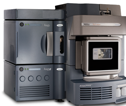
ACQUITY UPLC I-Class/ Xevo TQ-S micro IVD System.