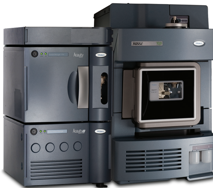
Figure 1. The Waters ACQUITY UPLC I-Class System with FTN and Xevo TQD Mass Spectrometer.

Here we describe a clinical research method using protein precipitation of a plasma sample with internal standards. Chromatographic elution was completed within five minutes using a Waters™ CORTECS C 8 Column on an ACQUITY UPLC I-Class System followed by detection on a Xevo TQD Triple Quadrupole Mass Spectrometer utilizing polarity switching (Figure 1).