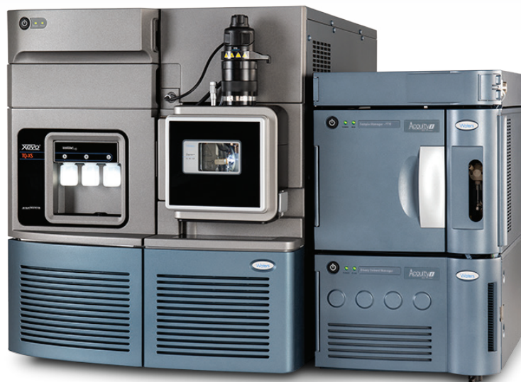
Figure 1. Waters ACQUITY UPLC I-Class System and Xevo TQ-XS Mass Spectrometer.

A method for the analysis of 19 steroid hormones has been successfully developed, utilizing UPLC to separate isobaric steroid hormones, allowing for low level quantification using the Xevo TQ-XS from only 200 µL of serum.