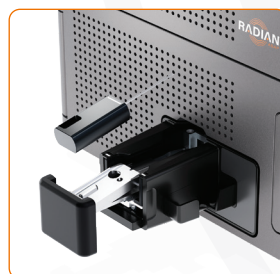
3. Insert capillary to start acquisition