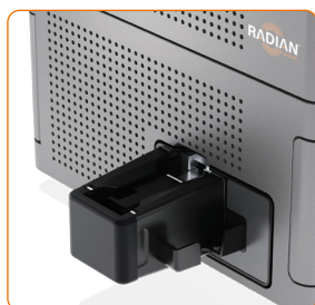
1. Clean the capillary