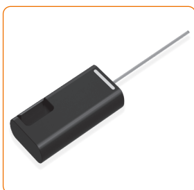
2. Load sample onto capillary