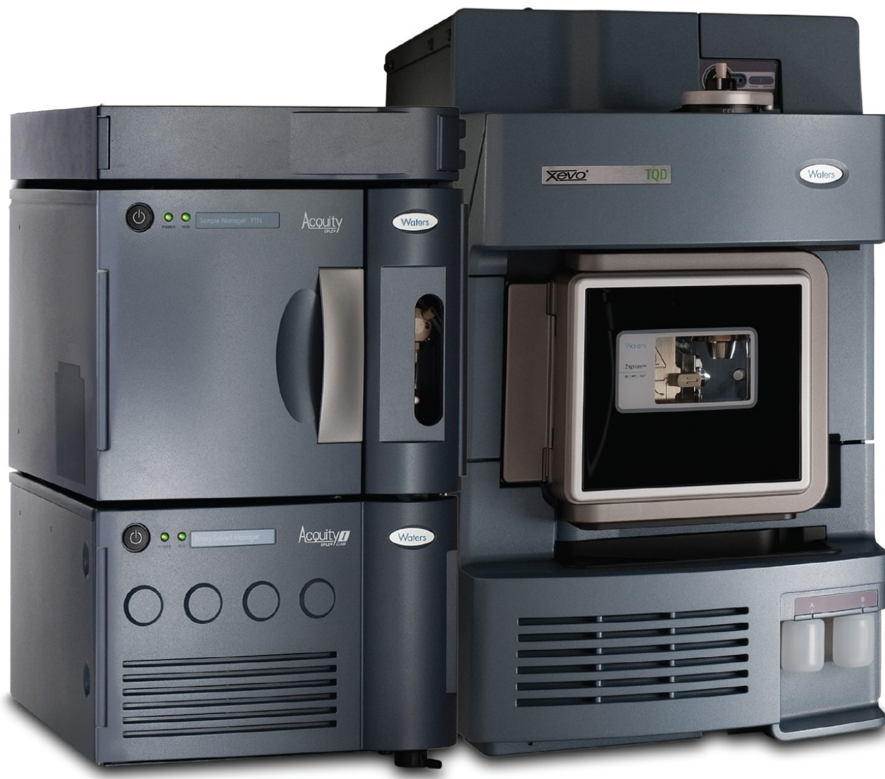
Figure 1. The Waters ACQUITY UPLC I-Class and Xevo TQD Mass Spectrometer.

a Waters ACQUITY UPLC BEH C 18 Column on a Waters ACQUITY UPLC I-Class followed by detection on a Xevo TQD Mass Spectrometer utilizing polarity switching (Figure 1).