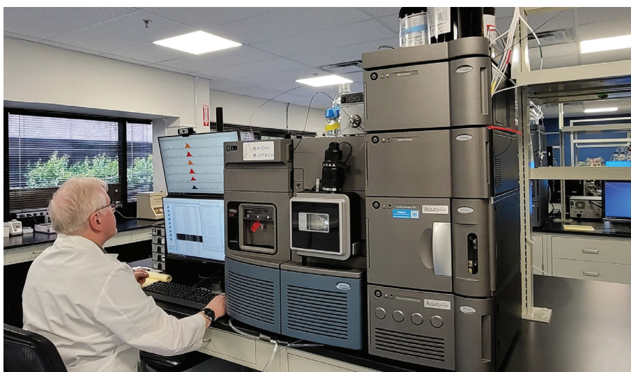
Waters instruments have helped BriOri BioTech accelerate its preclinical studies for a topical osteoarthritis drug.

Backed by a team with more than 150 years of combined experience in successful U.S. Food and Drug Administration (FDA) submissions, as well as history in successful NSAID commercial development, BriOri BioTech's first project is working to repurpose a COX-2 inhibitor from an oral to a topical formulation. This product could potentially alleviate chronic joint pain, as well as reduce the need for opioids in certain patient populations. The global market for topical pain relief treatments was estimated to be $8.8 billion in 2019 and is projected to grow to $12.2 billion by 2027 at a CAGR of 5.2% from 2020 to 2027. 1