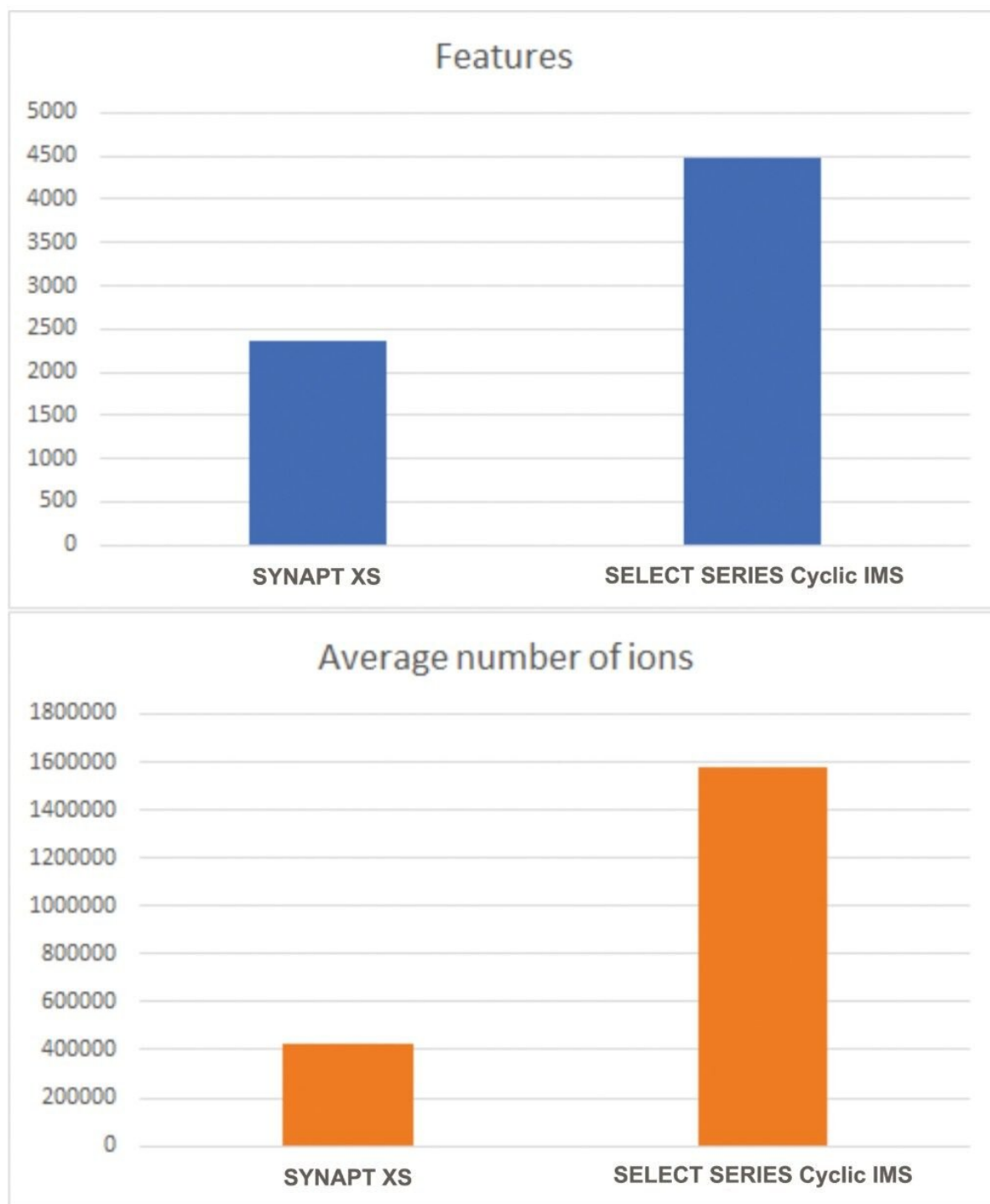
Figure 1. Comparison of the average number of peak-picked features and detected ions between the SYNAPT XS