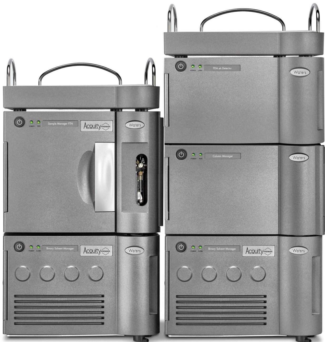
The ACQUITY Premier Multi-Dimensional System