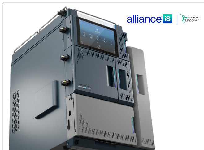
Figure 2. The Alliance iS HPLC System was designed to work with Empower Software.