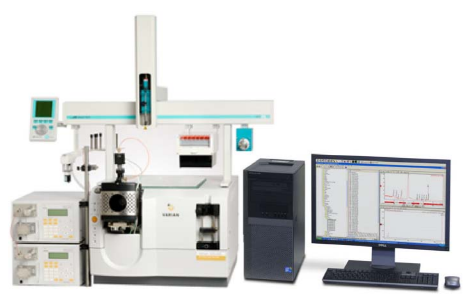
Figure 2 Suggested Layout with 212-LC and HTS PAL

Figure 2 shows a possible layout for the LC/MS with 212-LC pumps and CTC HTS PAL Autosampler.