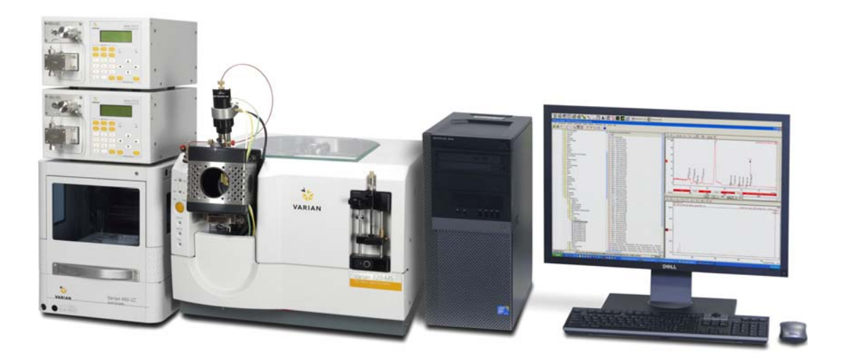
Figure 1 Suggested Layout with 212-LC and 460-LC

Figure 1 shows a possible layout for the LC/MS with the 212-LC pumps and the 460-LC AutoSampler.