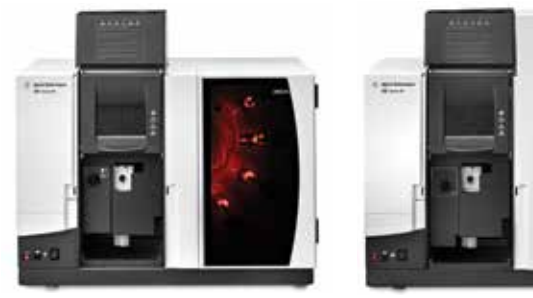
The 4 lamp 240FS AA