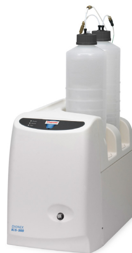
Figure 1. Dionex ICS-900 system

The work shown here describes the determination of inorganic anions in drinking water with the Thermo Scientific™ Dionex™ ICS-900 IC system and EPA Method 300.0. The Dionex ICS-900 IC system is an integrated, single-channel IC system designed for isocratic applications with suppressed conductivity detection.