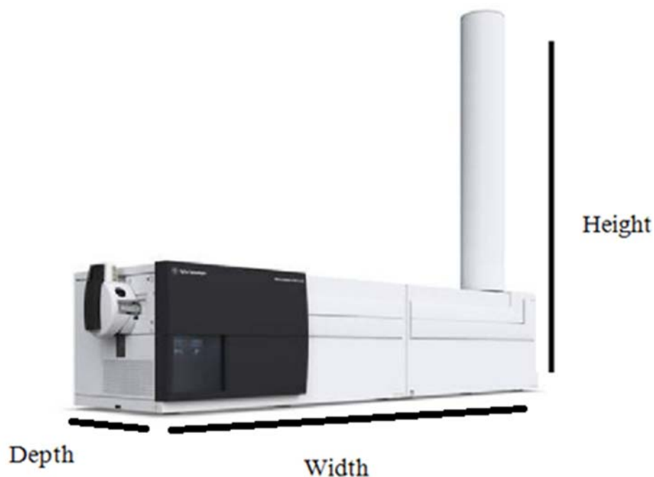
Figure 3 G6560 Ion Mobility Q-TOF LC/MS System