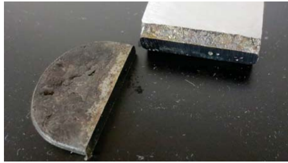
Figure 2: Thin portion of disk sectioned from thicker part of disk.