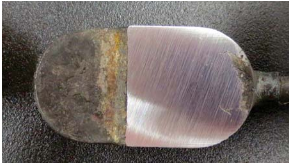
Figure 1: Dual thickness immersion disk.