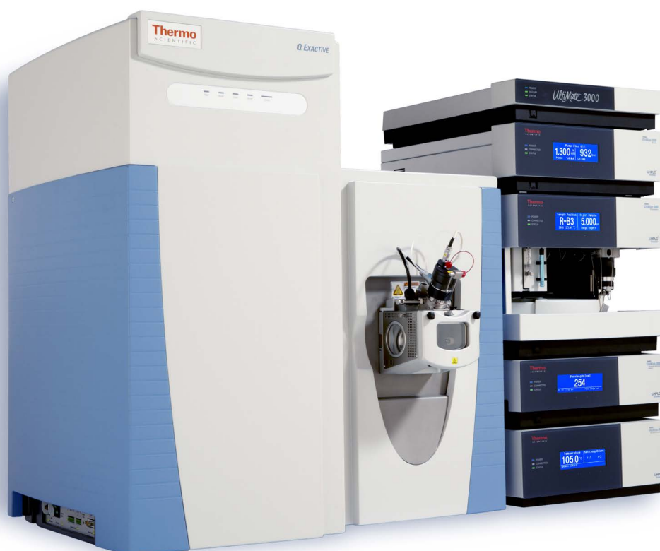
The Thermo Scientific Q Exactive™ mass spectrometer with the Thermo Scientific Ultimate 3000 RSLC.