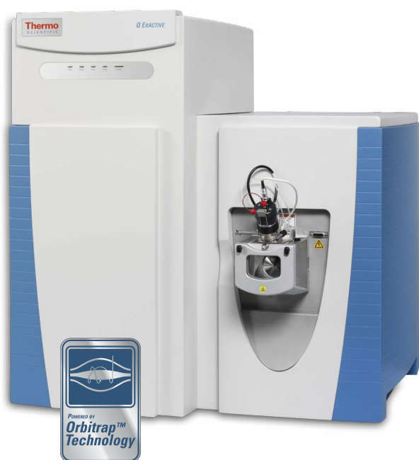
Thermo Scientific Q Exactive MS system.

The Q Exactive benchtop LC-MS/MS combines high-performance quadrupole precursor selection with high-resolution, accurate-mass (HR/AM) Orbitrap detection to deliver high performance and tremendous versatility.