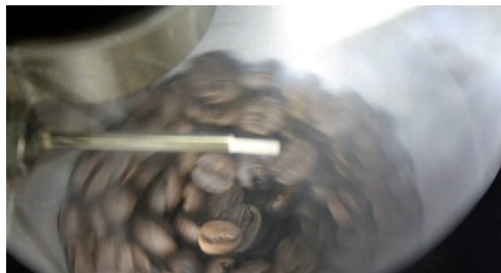
Figure 3 - Real-time monitoring of coffee bean roasting.

With the SICRIT® Heated Sampling Line it is possible to e.g. directly connect the exhaust line of a coffee roaster to an LC-MS and monitor the aroma components during the roasting process. With high resolution MS you can thereby follow the dynamic evolution of more than 500 VOCs in parallel during roasting (further reading Coffee Roasting App Note ).