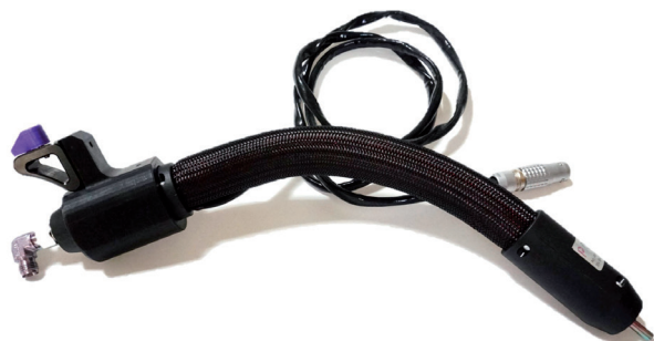
Figure 1 - SICRIT® Heated Sampling Line for use with SICRIT® Ionization Set SC-30.

SICRIT® Heated Sampling Line facilitates sample transport and avoids contamination.