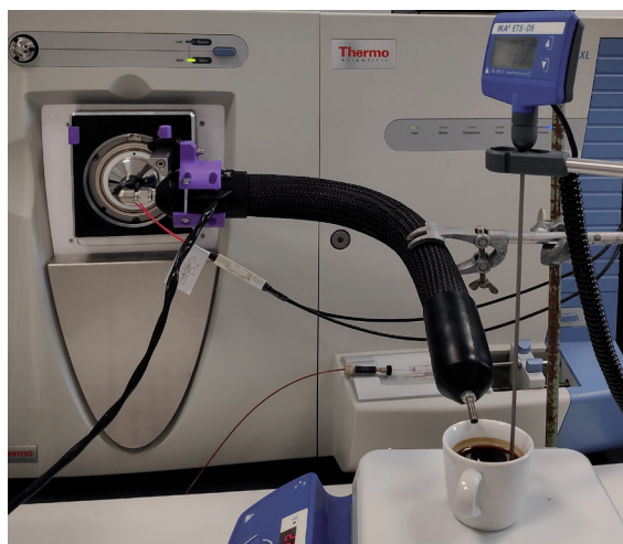
Figure 2 - VOC transfer for brewed coffee headspace analysis.

The SICRIT® Heated Sampling Line allows direct screening of challenging samples. For example, the direct aroma profiling of hot coffee. Here the hot liquid may condensate on the way in the MS which leads to contamination of the MS inlet and memory effects of especially semi-VOCs. These effects are avoided by the heated transfer line to the MS.