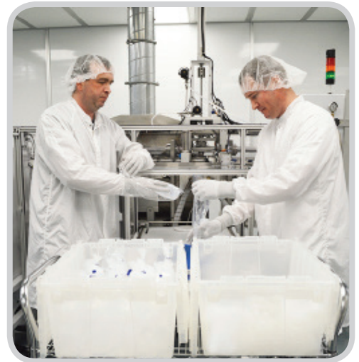
Purillex™ Bottle Production

Savillex's Purillex PFA and FEP bottles are manufactured from the highest purity grades of virgin fluoropolymer resin in an Class 10,000 ISO 7 cleanroom using unique stretch blow molding technology. They represent the state of the art in ultraclean fluoropolymer bottles for trace metals analysis. This technical note gives detailed information on bottle cleaning procedures along with high resolution ICP-MS (HR-ICP-MS) analytical data for 63 elements in Purillex PFA bottles following cleaning. The combination of unique molding technology and cleanroom manufacturing has enabled the production of fluoropolymer bottles that, once cleaned, have no elemental background contribution measurable by HR-ICP-MS.