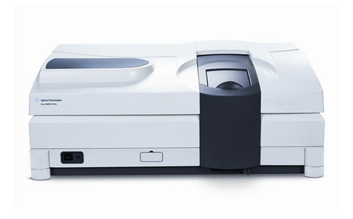
Cary 4000, 5000 and 6000i instruments provide a wide linear dynamic range

Diffuse reflectance accessories (DRAs) employ an integrating sphere design. This design greatly improves the efficiency with which light can be collected when analyzing highly scattering samples in either transmission or reflectance modes. For this reason, and because DRAs have their own light detectors, most system performance attributes must be characterized with the DRA installed. This data sheet uses potassium permanganate solution to demonstrate the excellent linear dynamic range of the Agilent External DRAs.