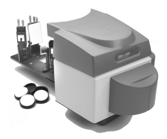
The DRA-2500 External Diffuse Reflectance Accessory