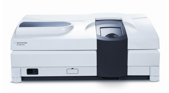
Cary 4000, 5000 and 6000i instruments provide excellent photometric accuracy

Photometric accuracy is part of the standard test required by many regulatory bodies including the Pharmacopoeias, and is typically performed on the spectrophotometer. When using accessories such as diffuse reflectance accessories (DRAs) which have in-built detectors, it is important to determine the photometric accuracy of the whole system. This test uses a standard potassium dichromate solution to demonstrate the photometric accuracy of the New Generation Cary 4000/5000/6000i spectrophotometers with the Agilent DRA.