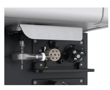
Close-up of the integrated Agilent AVS 6 switching valve.