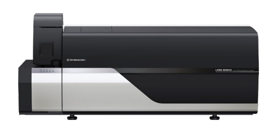
Fig. 1 External View of LCMS™-8060NX