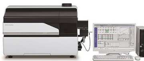
Fig. 1 ICPMS-2030

analysis of twenty-four trace and mineral elements in drinking water, including spike recovery, detection limits, precision and long-term stability referencing to US-EPA 200.8. [3]