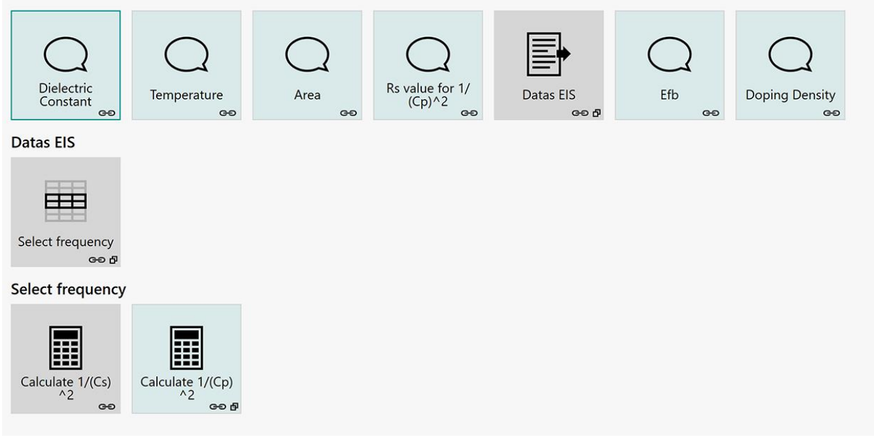
Figure 2. Data analysis commands within NOVA used to build a Mott-Schottky plot.

INTELLO 1.4 - Canned Demo - Mott-Schottky (Calculations Included) - Data (15/06/2023 09:32) VIRT00001