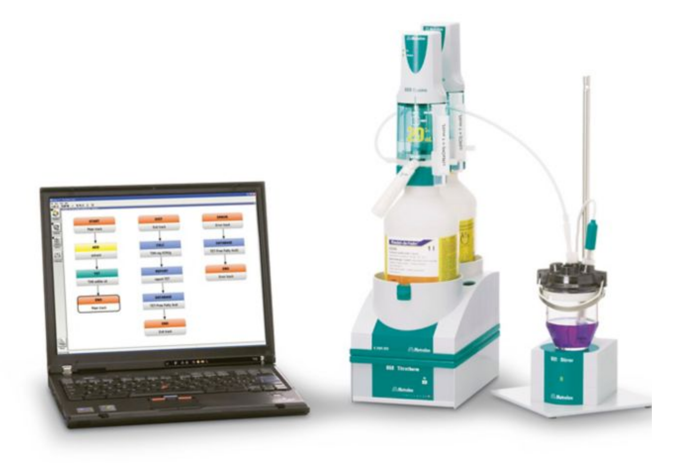
Figure 1. 859 Titrotherm equipped with a Thermoprobe and tiamo. Example setup for the analysis of aluminum.

After allowing to cool down to room temperature, an aliquot of the solution is used for titration. Ammonia buffer and hydrogen peroxide are added subsequently. The excess of EDTA is back titrated with Cu<sup>2+</sup> solution.