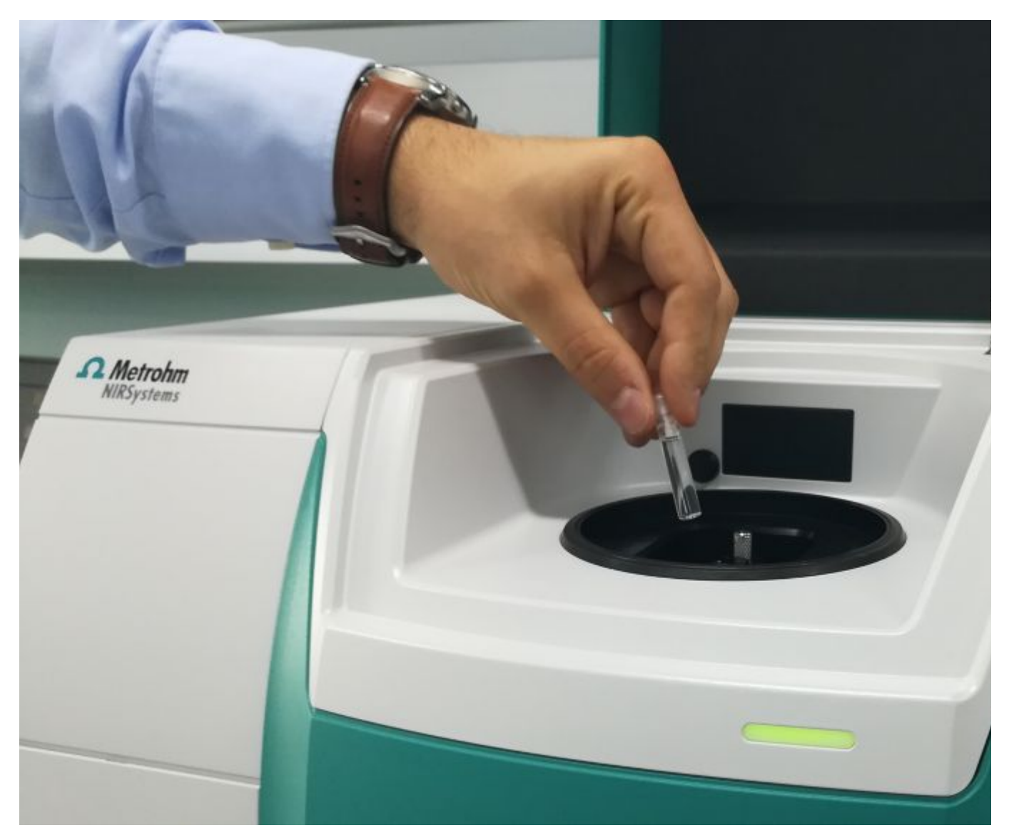
Figure 1. DS2500 Liquid Analyzer and a diesel exhaust fluid sample filled in a disposable vial.

Aqueous urea samples with different urea content from 0.5% to 40% (v/v) were measured in transmission mode with a DS2500 Liquid Analyzer over the full wavelength range (400–2500 nm). Reproducible spectrum acquisition was achieved using the built-in temperature control at 40 °C. For convenience, disposable vials with a path length of 2 mm were used, which made cleaning of the sample vessels unnecessary. The Metrohm software package Vision Air Complete was used for all data acquisition and prediction model development.