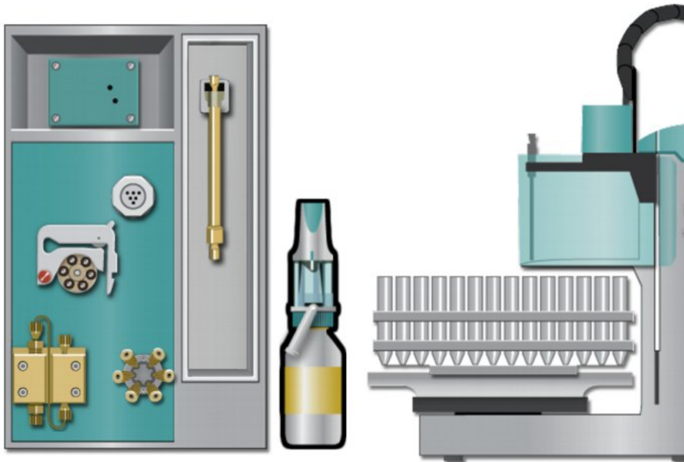
Figure 2. Compact instrumentation to quantify carbonate in sodium hydroxide: Compact IC Flex with a Dosino for MiPT and a 858 Professional Sample Processor.