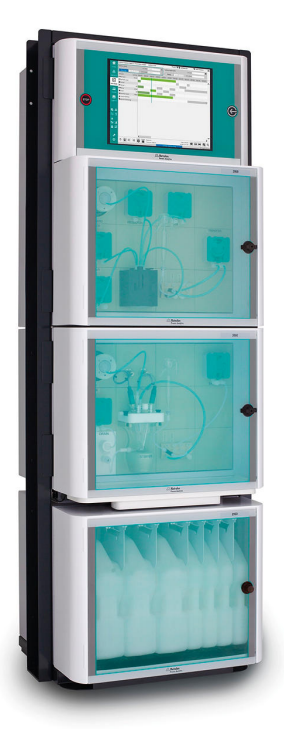
Figure 2. 2060 TI Process Analyzer for the online analysis of critical quality parameters in pickling baths using the method of titration.

over a wide concentration range—the 2060 TI Process Analyzer (Figure 2).