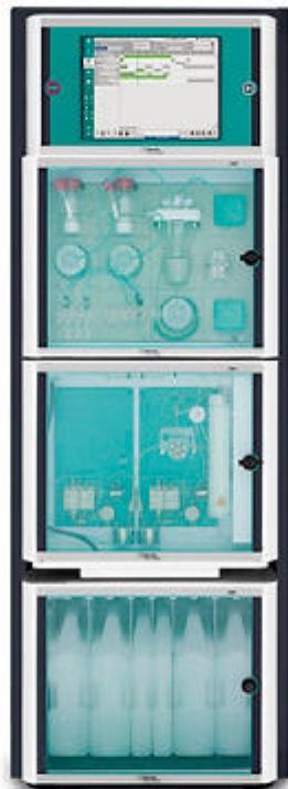
Figure 2. The Metrohm Process Analytics 2060 IC Process Analyzer, along with integrated liquid handling modules and several automated sample preparation options.

The 2060 IC Process Analyzer can run for extended periods in less-frequented areas as there is adequate space reserved for reagents, containers of ultrapure water and/or prepared eluent, and level sensors to alert users when liquid levels are low. By choosing a built-in eluent module and optional PURELAB® flex 5/6 from ELGA® for continuous pressureless ultrapure water supply, the 2060 IC Process Analyzer can be configured to run even trace analyses autonomously.