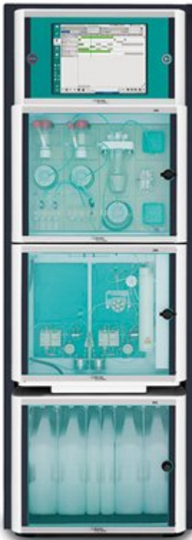
Figure 3. The 2060 IC Process Analyzer is available with either one or two measurement channels, along with integrated liquid handling modules and several automated sample preparation options.

The analysis is fully automatic. Lithium and other cationic component measurements are performed by non-suppressed cation IC followed by conductivity detection.