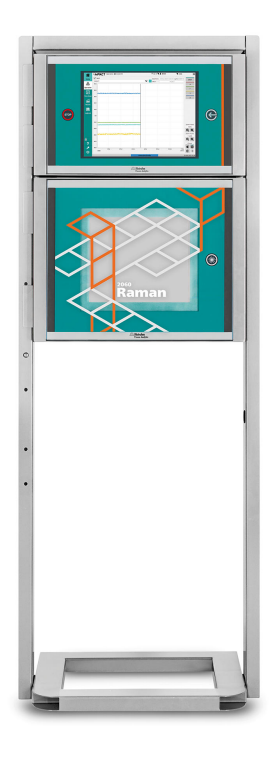
Figure 3. 2060 Raman Analyzer for quantitative analysis of lactate and glucose in a cell culture bioreactor.

Table 1. Prediction accuracy of the two measured parameters in a cell culture bioreactor as analyzed by the 2060 Raman Analyzer (Figure 3).