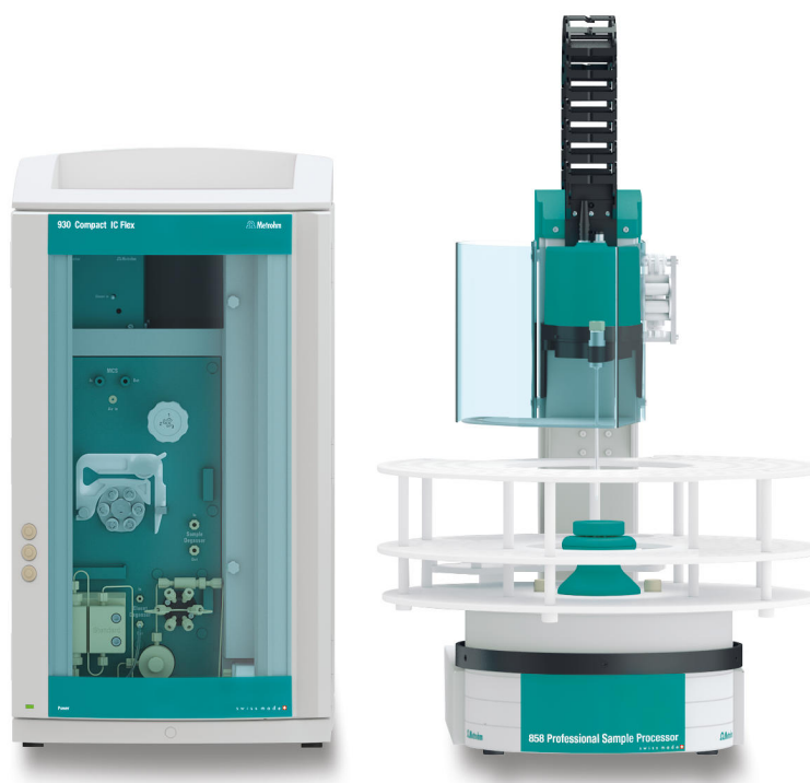
Figure 1. Instrumental setup including a 930 Compact IC Flex Oven/SeS/PP and an 858 Professional Sample Processor.