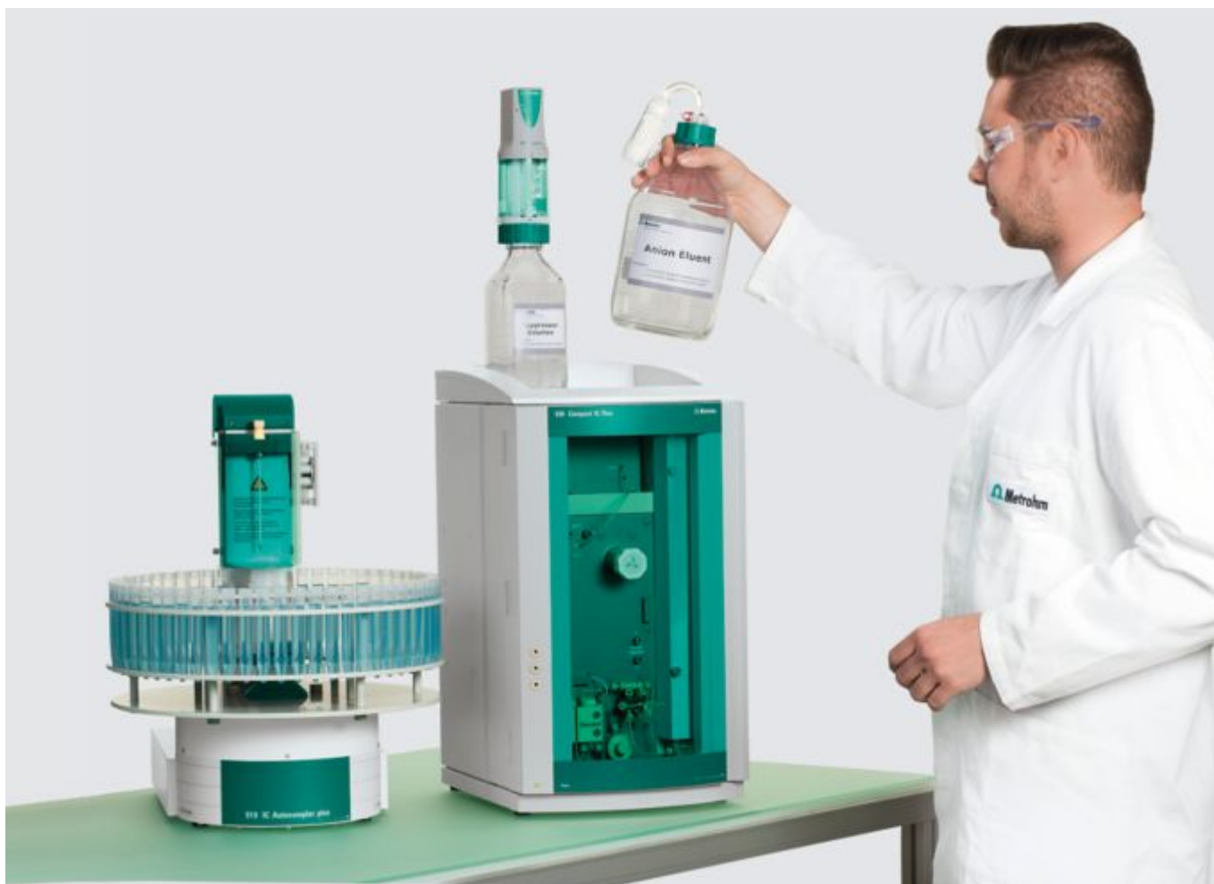
Figure 1. Compact, user-friendly Metrohm IC instrumentation to quantify various anions in explosives and explosion residues.

Artificial samples were dissolved in 10% methanol and automatically filtered using Inline Ultrafiltration. The Metrohm intelligent Partial Loop Injection Technique (MiPT) allows the injection of a precise variable volume depending on the sample load, and an automatic calibration.