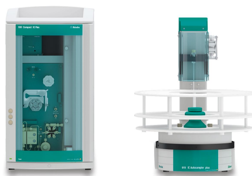
Figure 1. Instrumental setup including a 930 Compact IC Flex with IC Conductivity Detector and a 919 IC Autosampler plus.

The samples were injected directly into the ion chromatograph (Figure 1) without further sample preparation and analyzed using the method parameters given in the USP monograph (Table 1). Anionic components were separated isocratically on a Metrosep A Supp 1 - 250/4.0 column containing the alternative packing material L46. The conductivity signal was detected after sequential suppression.