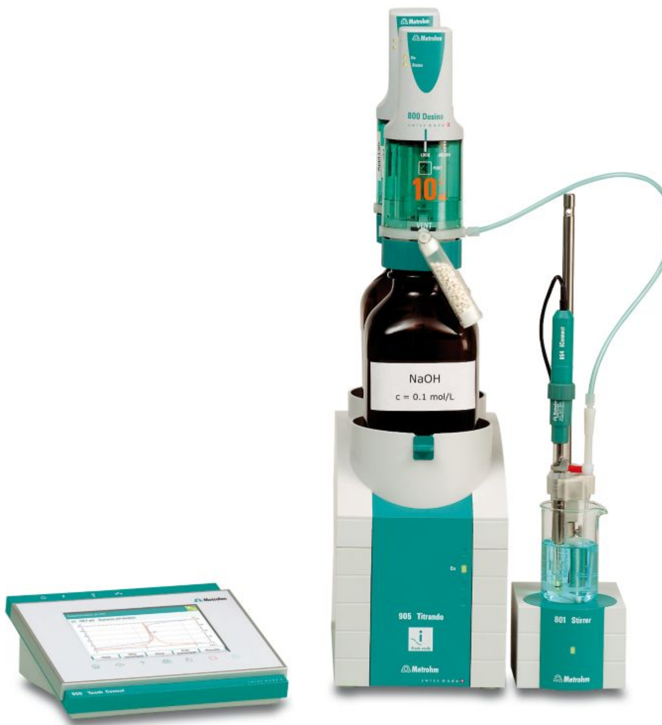
Figure 1. 905 Titrando equipped with a Solvotrode easyClean for the analysis the epoxide equivalents controlled by a 900 Touch Control.

This non-aqueous titration is performed on a 905 Titrando system equipped with a magnetic stirrer and a Solvotrode easyClean for indication.