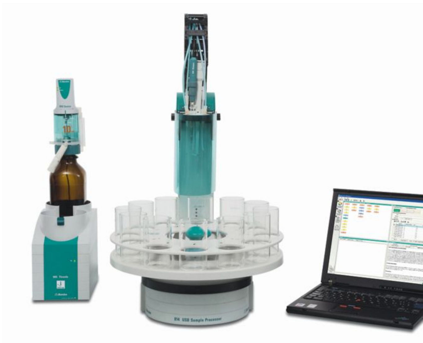
Figure 1. Titrando system consisting of an 814 USB Sample Processor in combination with a 907 Titrando and tiamo.